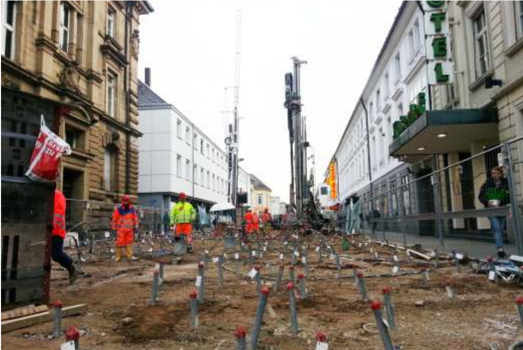
Drilling and grouting works in the Karl-Friedrich-Street